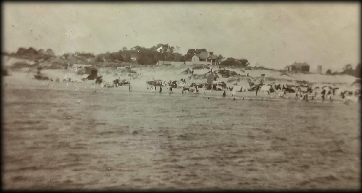
Dunluce estate 1910

We are committed to historical preservation and awareness. By using our venue, you are supporting the conservation of a historically listed building and you help to keep its stories alive.